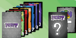
dragon cards mission cards